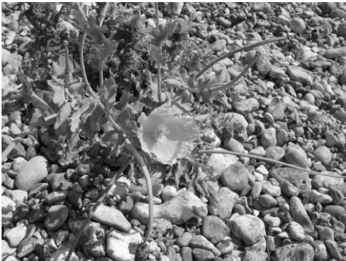
Yellow Horn Poppy

The vegetated shingle is so called because it supports a variety of plants, such as sea kale, yellow horned poppy and viper's bugloss, that have adapted to living in this harsh, exposed environment.